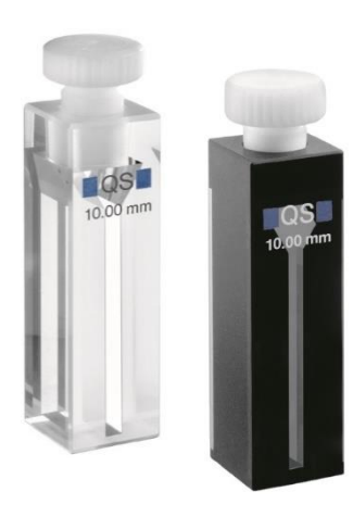
Non-masking and self-masking cuvettes.

As the variety of cuvettes has increased to serve the many special applications that have developed in recent years, ensuring you have the best cuvette for your application AND for your instrument has become much more difficult.