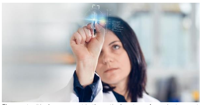
The most critical component in the optical system of your instrument

One of the single most important features of a cuvette is that it has to be as "invisible" as possible to the wavelengths of light you are using to make your measurements. Some of the factors that instil this "cloak of invisibility" are the type and quality of the materials used; the flatness and finish of the optical surfaces; and the parallelism of its construction.