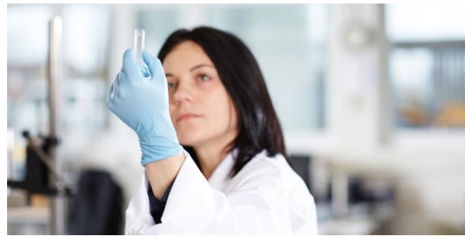
Rotate and twist the cuvette to better view the surfaces.

Rotate and twist the cuvette to better view the surfaces, but don't forget you will only see problems